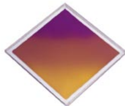
Figure 1 Transparent yellow-red-violet-switching of a dye containing hydrogel.

The figures 1 –3 show examples of the temperature controlled colour or respectively translucency conditions when using intelligent synthetic layers.