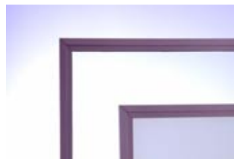
Figure 3 Two thermotropic windows. The one in the back ground is in the transparent and the one in the front in the translucent state.

Fraunhofer-Institut für Angewandte Polymerforschung Chromogenic Polymers Volmerstraße 7B 12489 Berlin-Adlershof Germany